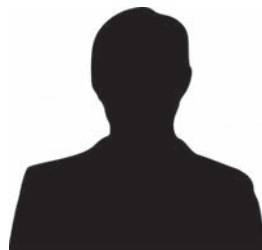
No photo submitted

Age: 63 Years of residence in home county: I have been a resident of Boundary County for over 50 years. Marital status/family: wife (married for 38 years), eight children and 15 grand children. Education: Graduated Bonners Ferry H.S. 1971, University of Idaho B.S. in Business – 1975 Recent or pertinent employment or professional qualifications: Business owner. Past—logging, construction, log home builder. Currently—manufacturer of timbers and timber and log products.